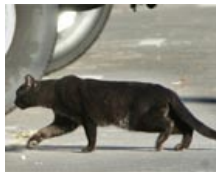
On the job click to enlarge

Unlike other strays that might rub up against a leg hoping for a crumb or a head rub, these felines are so unaccustomed to human contact that they dart away when people approach. Feral cats cannot be turned into house pets. When they end up in municipal shelters, they have little hope of coming out alive.